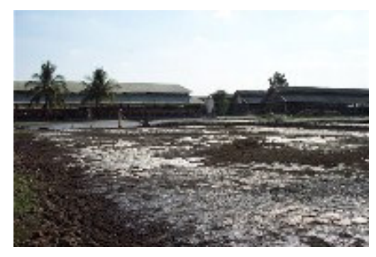
Figure 1 Lagoon, The Local Common Practice

HBC and PhilBIO propose a novel animal waste management system to recover methane gas emissions as an alternative to current open lagoon systems. Wastewater treated in these lagoons is often at an ambient temperature of around 35°C, and under anaerobic conditions. The result of this is that biogas (mostly methane) is emitted continuously to the atmosphere, as can be seen in this typical farm lagoon system image.